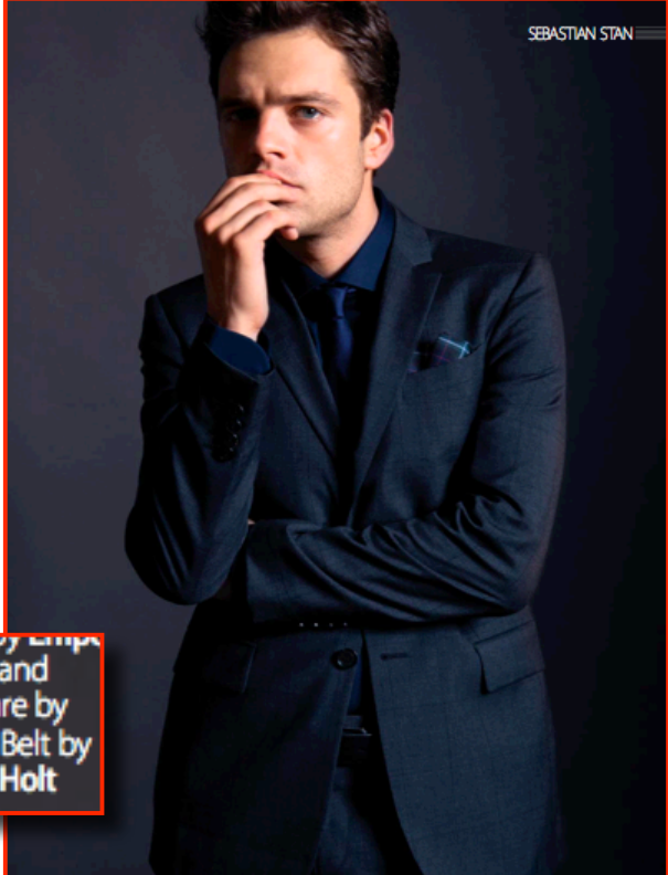
Down shirt by Emporio Armani; Tie and pocket square by The Tie Bar; Belt by Fullom and Holt